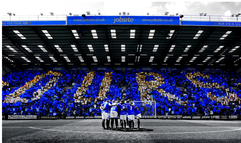
Join the Pompey Supporters' Trust for just £5 by visiting pompeytrust.com

To investigate and propose new ways of raising finance to help ensure the long-term sustainability of Portsmouth Football Club.